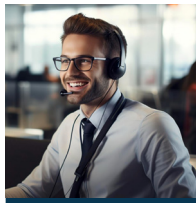
Finance & Insurance